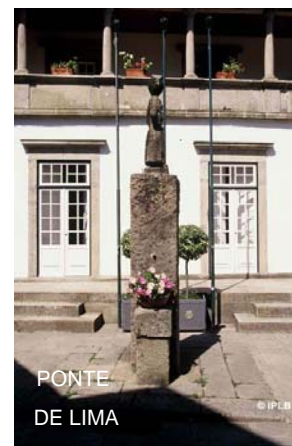
PONTE DE LIMA