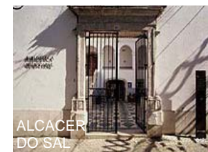
ALCACÊR DO SAL