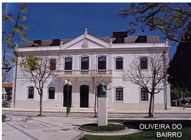
OLIVEIRA DO BAIRRO