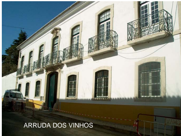
ARRUDA DOS VINHOS